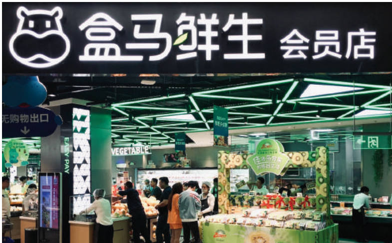
Freshhema (Hema Xiansheng) “Hema Supermarket” by Alibaba Owner