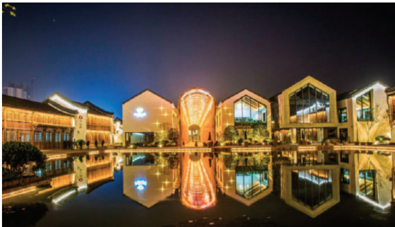
Start-up ecosystem “Dream Town Internet Village” 人工智能小镇 Artificial Intelligence Town